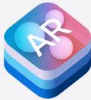
APPLE AR KIT